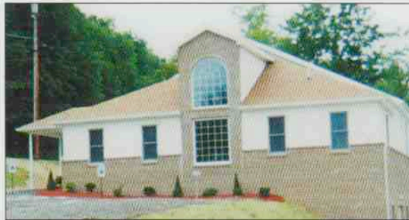
Alexandria, PA: The new church soon after construction was completed