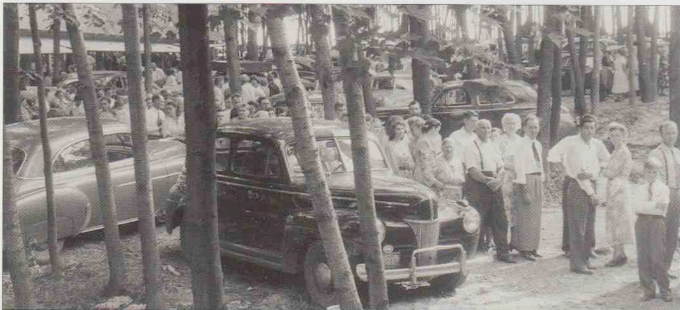
HISTORICAL PICTURE: Cafeteria line at Penns Creek Camp with tabernacle in background to left

✞ [CONTINUED FROM PAGE 3] hand- outs from a political pedestal as politi- cians in Washington might do, but He Himself came where we are. He would be weary and need rest, lonely and need companionship, forsaken of men but remembered by His Father. Today He is touched with the feelings of our infirmities therefore as our Kinsman He knows how to succor us.