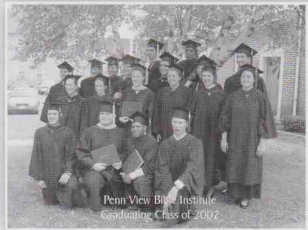
Penn View Bible Institute Graduating Class of 2002

As we prepare to go out into a dark, dying world that looks impossible to reach, let us remember what David said when he approached the giant Goliath, "Thou comest to me with a sword, and with a spear, and with a shield; but I come to thee in the name of the Lord of hosts, the God of the armies of Israel, whom thou hast defied. This day will the Lord deliver thee into mine hand; that all the earth may know that there is a God in Israel." "It is not by might, nor by power, but by my spirit saith the Lord of hosts." Graduates, the "world is our parish." Let us not fail our fellow students; let us not fail our school, but above everything else let us not fail our Lord who is counting on us to fulfill the call that he has placed on our hearts. Graduates we have a call, we have a mission, that is to spread the glorious gospel of Jesus Christ to the ends of the earth.