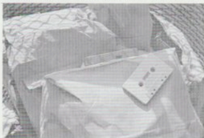
"Junk" to be burned.

the fire was burning in the barrel, the fire was burning in the hearts of students and faculty members as they rejoiced at what God has wrought. As one student testified after throwing a bag of items into the barrel, "I'm glad to get rid of my junk!" Praise God for his revival power! Pray with us that those who have made such a good start will permit God to perfect that which has begun in their hearts.