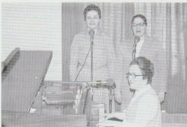
The Victory Trio ministers in song.