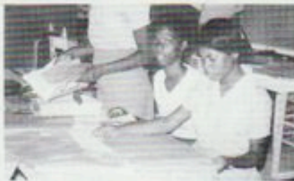
Preparing the patterns.

Some of our Bible School students come to this school too. Would you believe that they go to school in the mornings to high school, come to Bible School in the afternoon and then to the sewing school at night? Some of them without hardly any food to eat all day long. For some of them must travel all the way into the city and there can be very trying times in seeking to find transportation back to Carrefour again and then to get to Bible School on time. It is after dark when they finally go to their homes to study for the next day. Numerous students have no lights in their homes and go outside to study under street lights in order to learn their lessons for the following day.