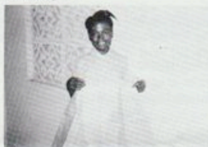
The paper pattern.

to church. Her heart is so hungry... so she comes to sewing school and then slips over to the church to hear the Word on Tuesday nights when we are having Bible study. When the study is over she goes back to sewing school. Her teacher knows where she goes and does not say anything to her. On Fridays she comes to Chapel and hears again the Word she loves. Her heart yearns to come on Sundays too but she is not permitted to do so by her family.