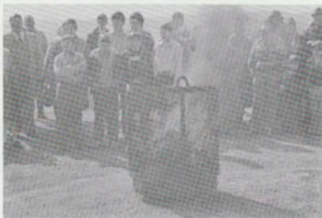
The Fire burns!

After the scheduled time of services had expired, the Trio continued an extra week ministering to the students during the mornings with a deepening in the lives of many. The last Friday, March 7th, was a time of rejoicing as the students gathered around a barrel into which several threw items involved with their former lives of sin and worldliness. As