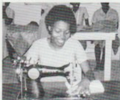
Time to use the machine.

When we enter the room there are bowed heads looking at folded paper on the tables before them and they are raised now and then to glance at the blackboard where the teacher is writing instructions on how to cut out a pattern. Yes, they are making their own patterns. They don't buy them. Their little notebooks are filled with miniature samples cut out of white or maybe pink paper and placed neatly on the pages, beside the written instructions.