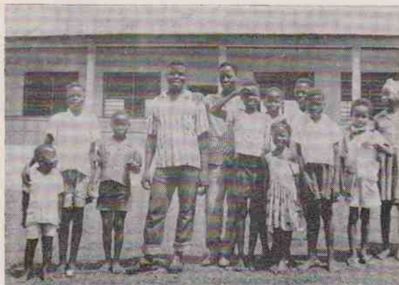
Some of the students in front of the school. Nice looking group, isn't it?