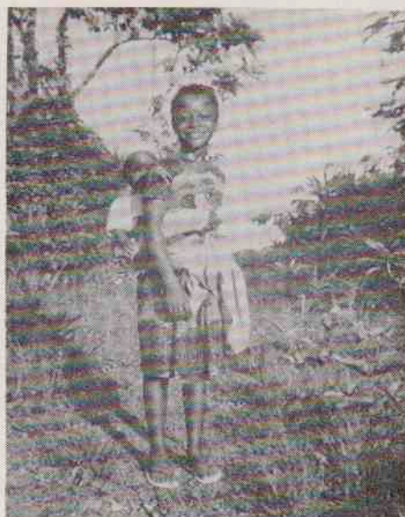
A big sister plays nursemaid to a little one, and carries it native style, slung around the waist, and wrapped in cloth.