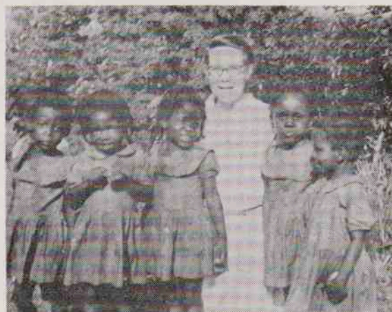
Look at these dear little faces. The news about Christ has made them happy.