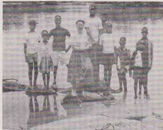
A group of young people with their Missionary down by the river, on the way back from a picnic.

who have taken refuge in Florida from the Communists. They are working with another Holiness group there in a regularly-chart-ered, approved denomination, and gifts made to them to continue their work may be deducted as charitable contributions, they tell us, and they will send you a certified receipt for anything you send to help them. Pray for them. We will have pictures of their work soon, too.