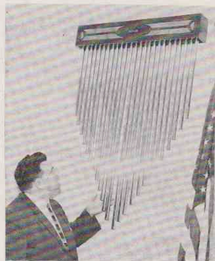
Young People Donate New Church Chimes