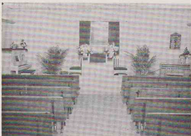
Interior View of Shamokin Church