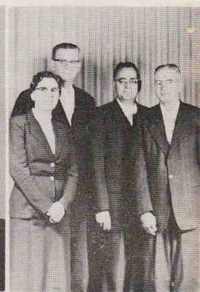
West Virginia Quartette SINGERS

Soul-Stirring Messages - Anointed Singing - Good Meals