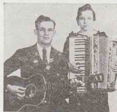
The Sorrells Gospel Singers Sunbury, Pa.