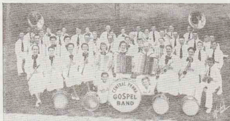
Central Penna. Gospel Band Appearing July 31.