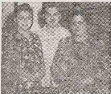
THE CLAUD INDIAN TRIO, SINGERS AND MUSICIANS COUDERSPORT, PA.